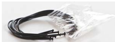
MK-1000-WE (8 units)